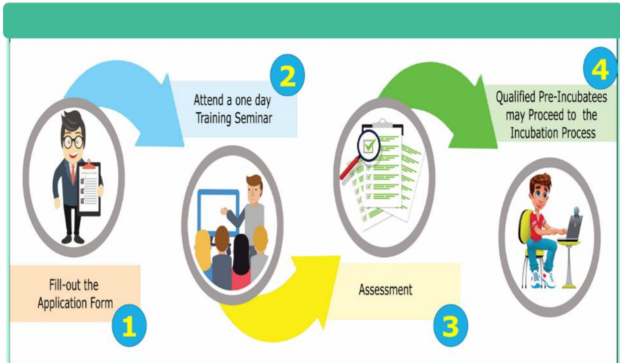
Figure 1. Pre-incubatee Registration Procedure.

After the individual satisfies the pre-incubatee selection criteria, he/she may enroll as incubatee and will then undergo the incubation process following the steps as shown in Figure 2.